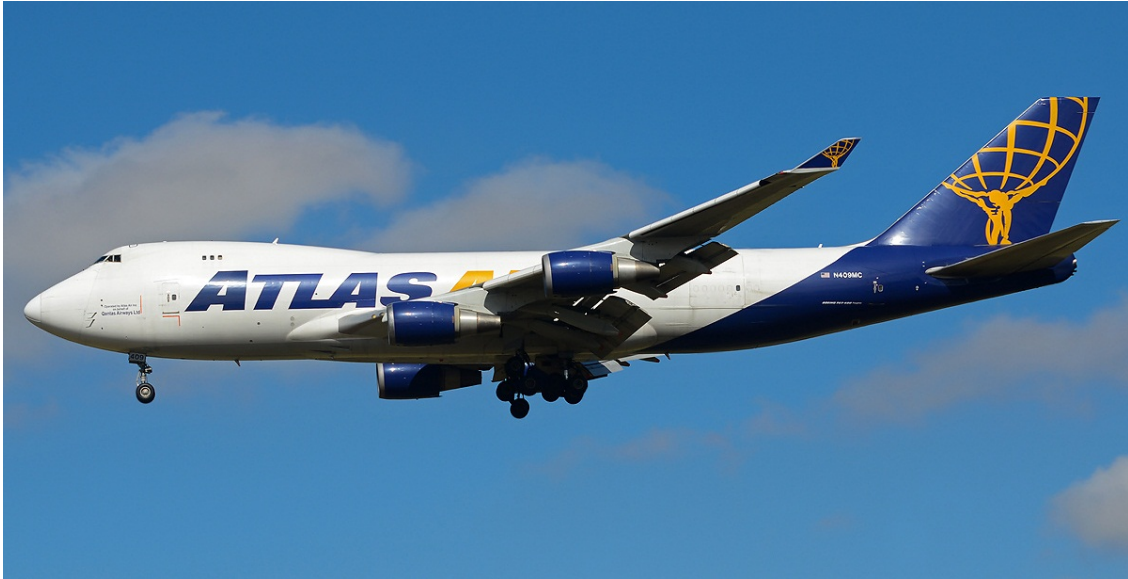
Figure 1: B747, US-registered N409MC

On 9 September 2012, the flight crew of a Boeing 747-47 UF/SCD freight aircraft, registered N409MC and operated by Atlas Air Inc. (Figure 1), conducted a flight from Honolulu, United States (US), to Auckland Airport, New Zealand. From Auckland the flight continued to Melbourne Airport, Victoria, with an estimated time of arrival of about 1800 Eastern Standard Time. 1 The aircraft was being operated as a freight flight for an Australian operator and had four US flight crew on board due to the length of the flight.